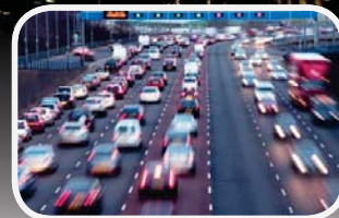
Intelligent Traffic Systems